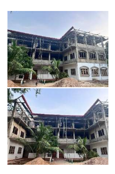
Completion is expected to take 6 months.

Work on the Eliza Agnew Building is progressing rapidly. Most of the roofing sheets have now been put up.